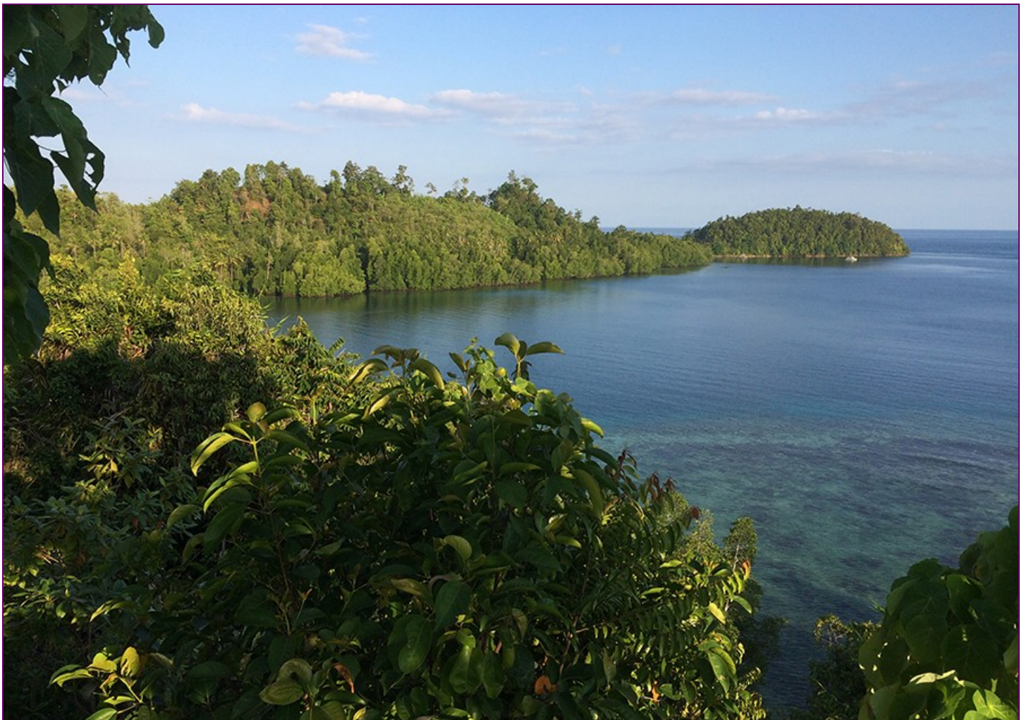
Weda Bay Halmahera

Two different animals were seen in Tangkoko (North Sulawesi).