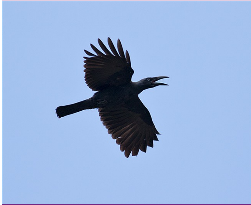
Long-billed Crow and Sacred Kingfisher , en-route to Weda