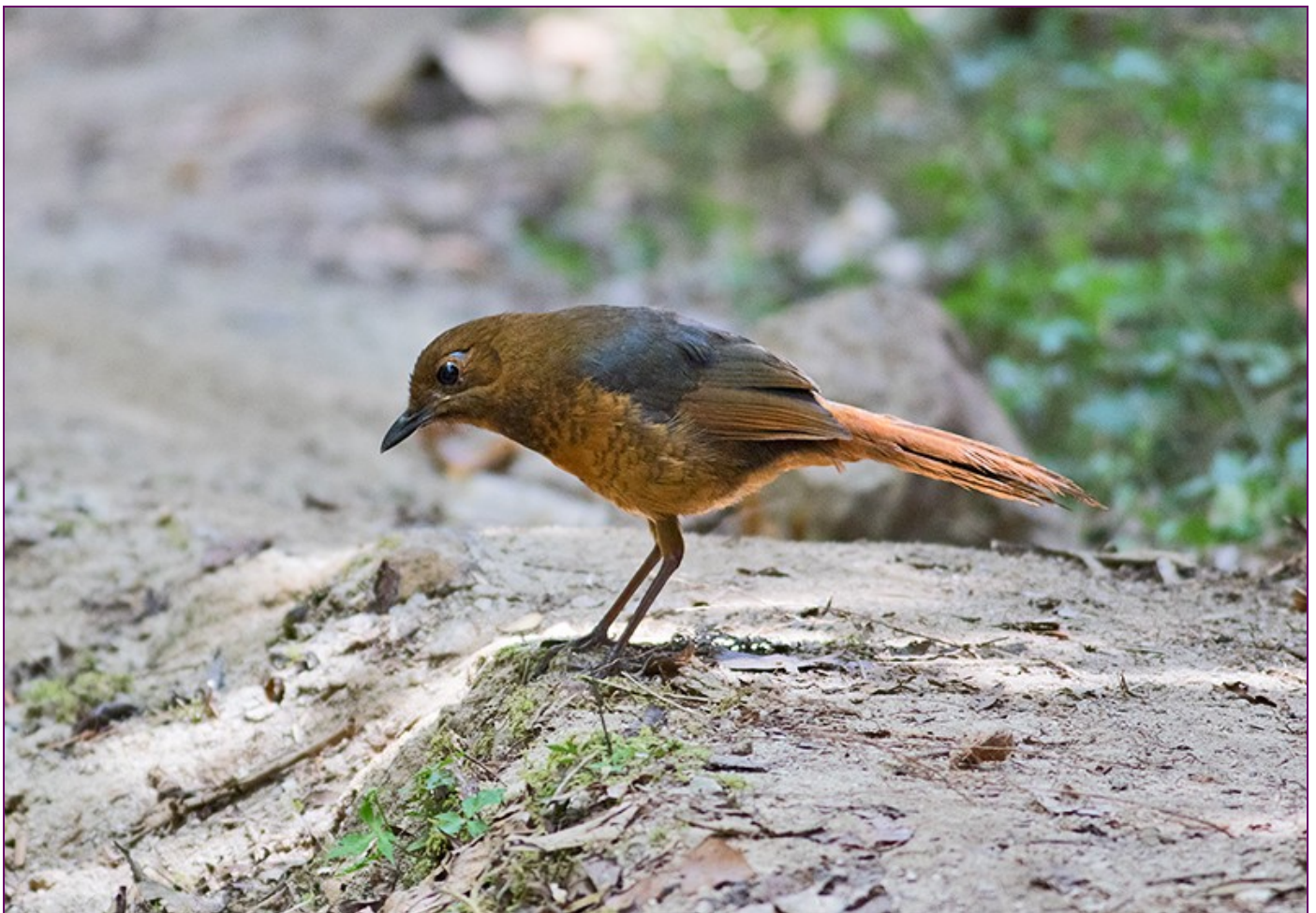
Geomalia Lore Lindu (Sulawesi)

Acclaimed British naturalist (and co-conspirator with Charles Darwin on the development of the theory of evolution of species by natural selection), Alfred Russel Wallace spoke of the “peculiar”, and it was indeed the peculiar, or ENDEMIC, which was the undoubted focus of this tour. Birders come to Sulawesi and Halmahera to see birds you cannot get anywhere else. While the uniqueness of these species is a clear attraction all of its own, many among them are also stunning birds to boot, and are rightly revered as some of the most highly desired species in all of the region; a quick perusal of our final bird list reveals exquisite birds like Sulawesi Dwarf-Kingfisher , Lilac-cheeked and Green-backed Kingfishers , Knobbed and Blyth’s Hornbills , Moluccan and Ivory-breasted Pittas , Purple-winged and Azure Rollers (A.K.A “Purple Dollarbird”), Rusty-backed (Red-backed) Thrush , and the astonishing Wallace’s Standardwing (a spectacular endemic bird-of-paradise), a bird which Wallace himself was credited with the discovery of during his long expedition to the “Malay Archipelago”, (which encompassed these islands too in his definition). A list of some 280 birds were recorded on this tour, with just a handful only heard (5 species), and many of these were seen long and well by all present, like the strange Geomalia (photo below), and Maleo , the handsome Rusty-backed (Red-backed) Thrush , and most of the kingfishers, including the notoriously difficult Scaly-breasted Kingfisher .