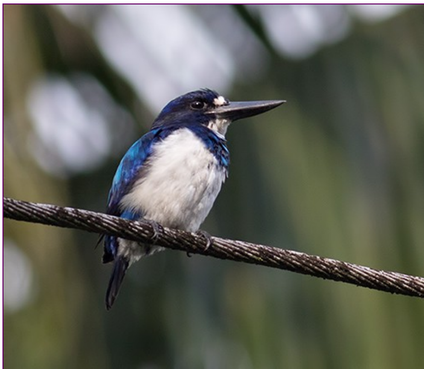
Female (above) and immature (below) Blue-and-white Kingfishers on the wires en-route to Weda