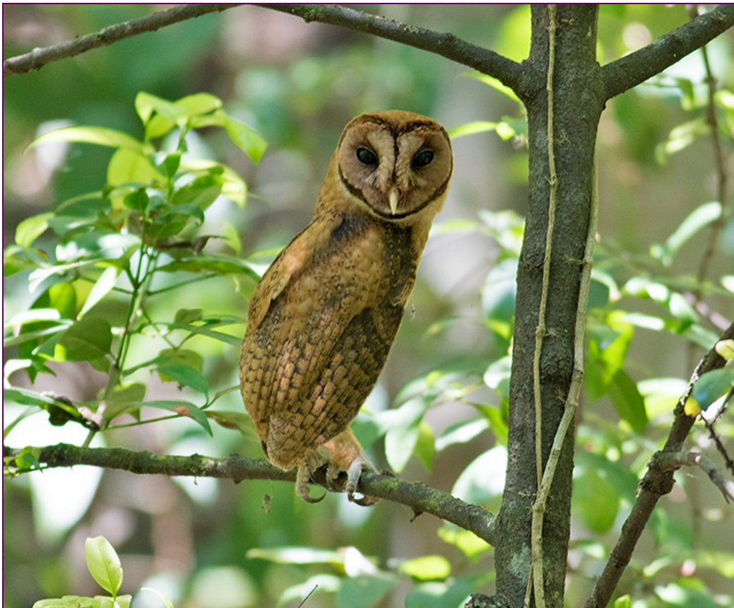
Minahassa Masked-Owl Tangkoko

This tour was incredible for nightbirds; 9 owls, 5 nightjars, and 1 owlet-nightjar all seen. This bird was entirely unexpected; rarely seen at night; we were very fortunate to see in the daytime. Voted as one of the top five birds of the tour.