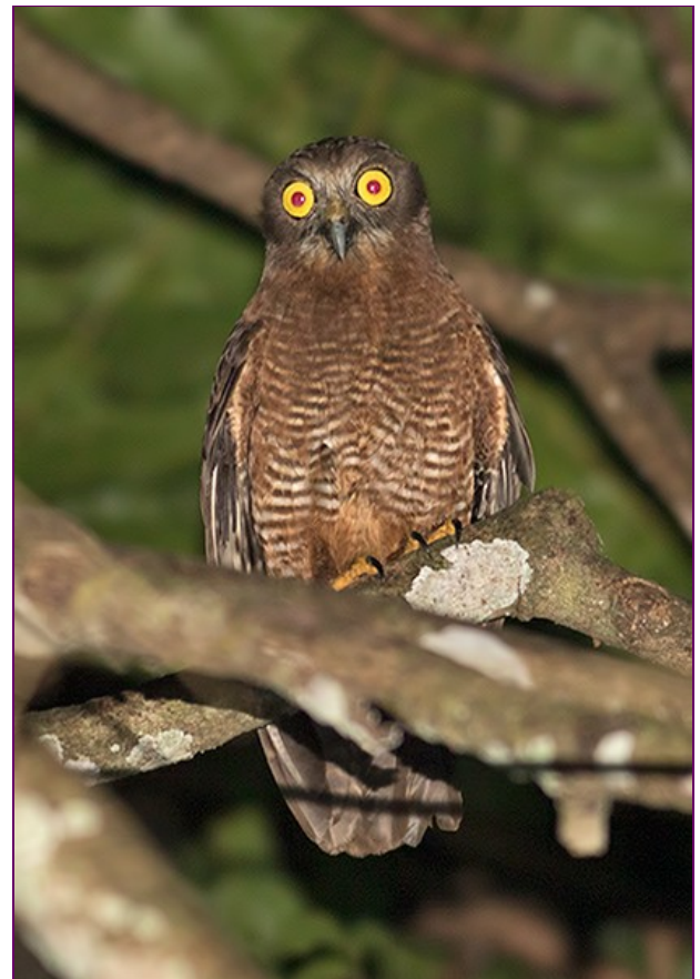
Moluccan Scops-Owl & Halmahera (Boobook) Hawk-Owl Weda, Halmahera