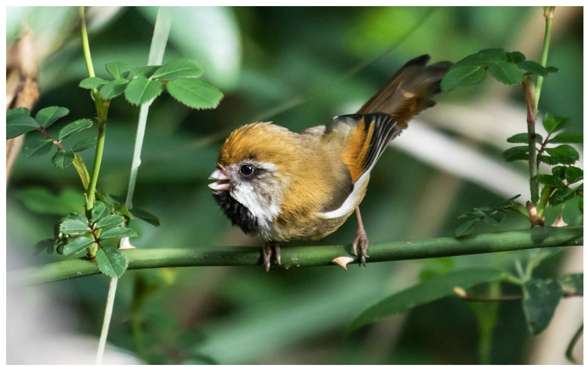
Golden Parrotbill from Yushan

There was also a nice selection of other birds to round out the day, including Ring-necked Pheasant, Eurasian Moorhen, Black-winged Stilt, Greater Painted-Snipe, Wood Sandpiper, Oriental Pratincole, Black-winged Kite, Long-tailed Shrike, Oriental Skylark, Gray-throated Martin, Zitting Cisticola, Eastern Yellow Wagtail, and Scaly-breasted Munia.