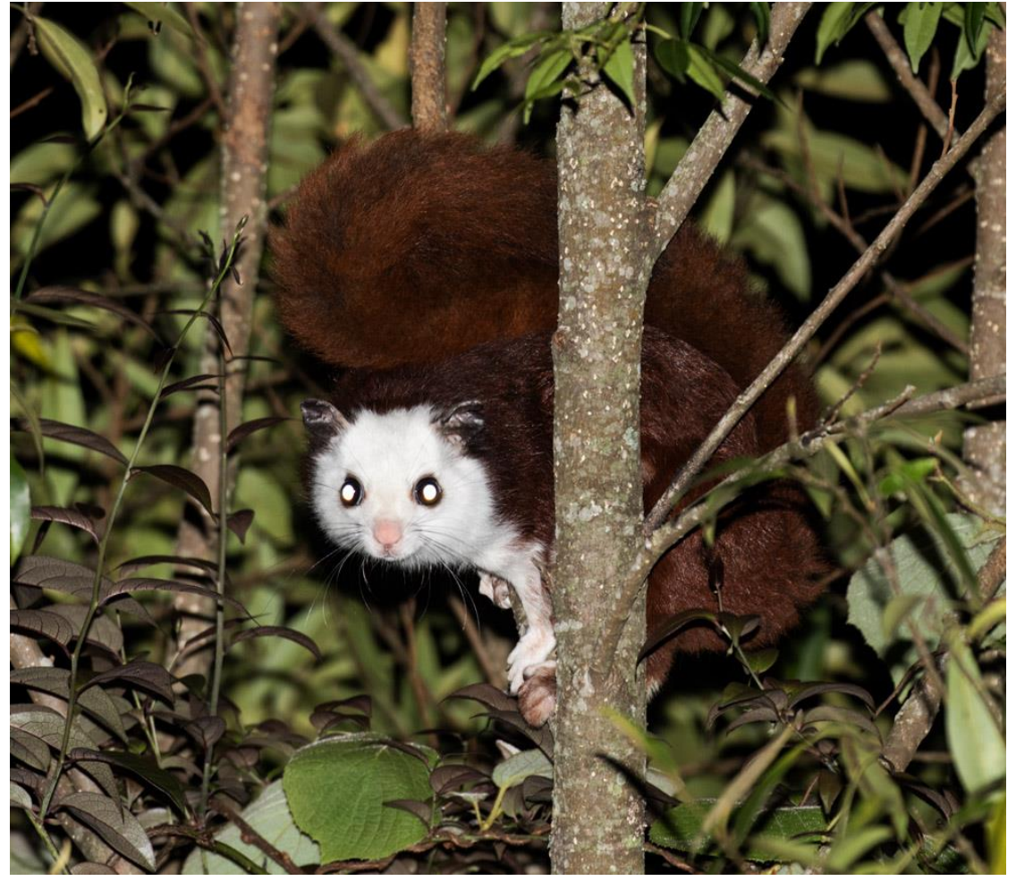
Red-and-white Flying Squirrel at Dashueshan