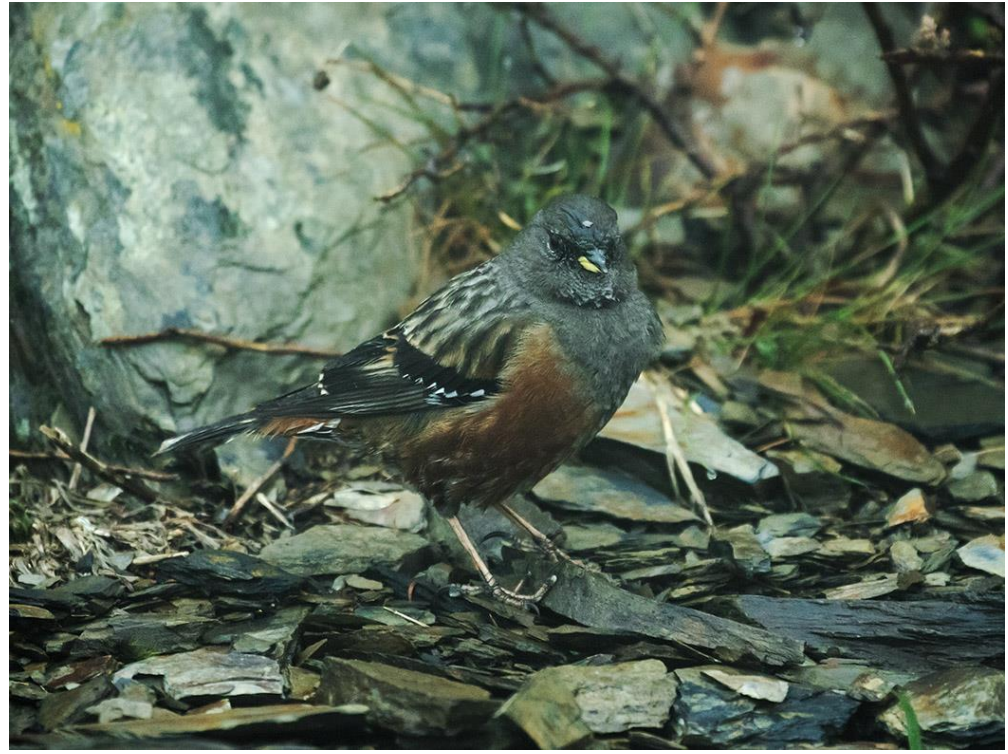
Alpine Accentor at Wuling