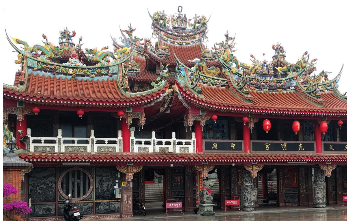
The temple with Collared Scops-Owl

22 April: The rain had stopped by morning, and weather would end up being nice for the rest of the trip. We departed a bit earlier than normal as we wanted to get up into higher elevations of Yushan National Park. Our first stop part way up the mountain got us what would turn out to be the tour's only Taiwan Barwing. We continued higher along the slow, windy road, seeing another male Mikado Pheasant before reaching the morning's main birding site of Tataka. The mixed broadleaf and coniferous forest here was full of birds and we quickly added Taiwan Fulvetta, Golden Parrotbill (photo on next page), Ferruginous Flycatcher, and had much-improved views of Flamecrest and Taiwan Bush Warbler. We had a distant Eurasian Nutcracker, and spent far too much time trying to see several incredibly uncooperative Taiwan Cupwings which only a few people saw. We then headed down out of the mountains into the humid lowlands north of Tainan City. Our afternoon stop was in some wetlands and farmland near Guantian, where we enjoyed seeing Pheasant-tailed Jacanas in full breeding plumage: