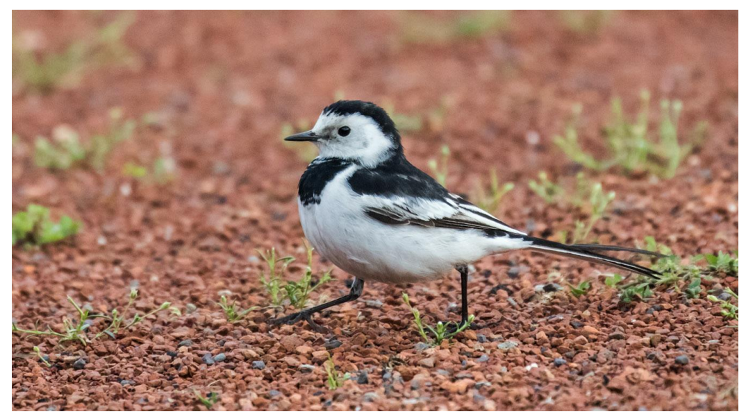
White Wagtail on Nangan Island

Sandpiper, the muddy inlet was covered with hungry wagtails including Citrine, Gray, White and two different races of Eastern Yellow Wagtail. We rounded out the day at a hole-in-the wall restaurant recommended by a friend of Yvonne's, where the food was fantastic – some of us thought was the best meal of the whole trip.