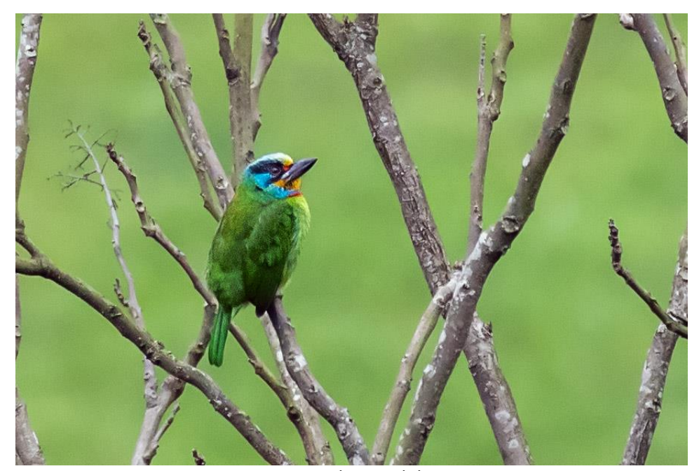
Taiwan Barbet at Shihmen

20 April: Rain continued through the night and into the morning, but kept to our schedule and had the first of many "convenience store" breakfasts at a local 7-11. We headed about 30 minutes up the road into the mountains where our first stop was cold, wet, foggy, and a bit frustrating. Our first bird was a Yellowishbellied Bush-Warbler that showed pretty well, but we could only hear the Gray-headed Bullfinches that were lost somewhere out in the mist. After getting poor views of Taiwan Bush Warbler and Taiwan Rosefinch, we gave up and drove up to the top of the pass at Wuling (10,700 ft./3260 m.). The birds were really tame here, so at least we could see them despite the fog, and we enjoyed White-whiskered Laughingthrushes, Collared Bush-Robins, and Taiwan Rosefinches hopping around almost at our feet, but there was no sign of any Alpine Accentors. Heading down the east side of the pass the weather started to improve. We stopped by a café for hot drinks where a mixed species flocks moved through the pines with Coal Tit, our first of many Taiwan