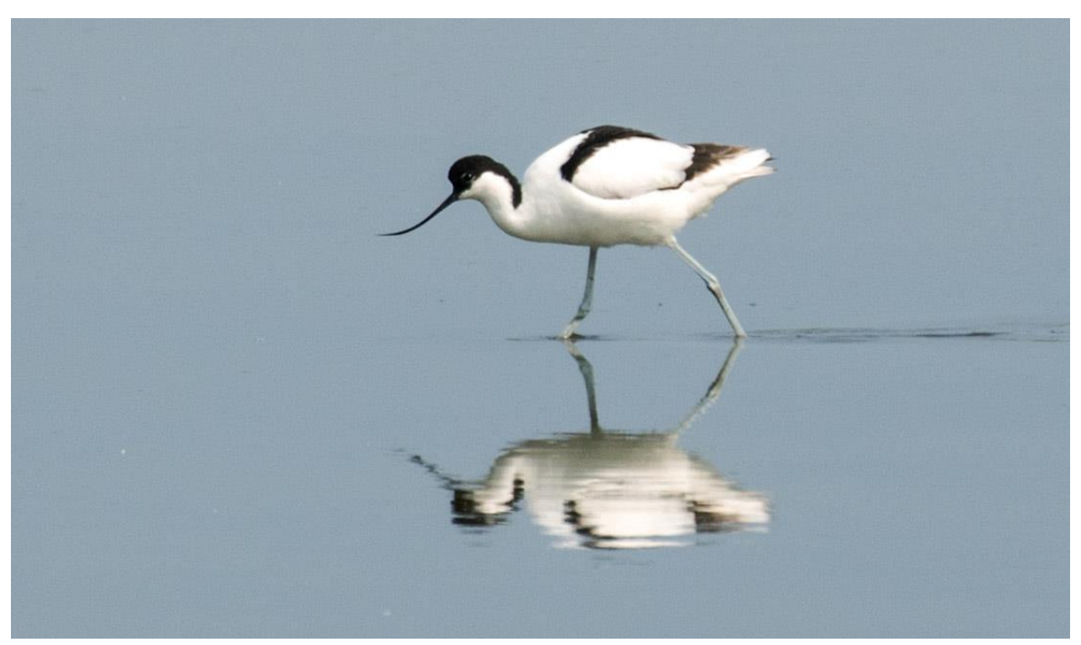
Pied Avocet at wetlands near Budai