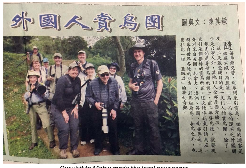
Our visit to Matsu made the local newspaper

17 April: Our last morning on Matsu was sunny and absolutely beautiful – not ideal for migration birding! We had a nice walk around the west side of the island enjoying the weather, scenery, and some common birds. We did add one scarce migrant, a Japanese Sparrowhawk, before heading to the airport and flying back to Taipei. We stopped at Guandu Nature Park on the north side of the city for some very productive birding. The wetlands held a nice variety of waterbirds including Eastern Spot-billed Duck, Green-winged Teal, Long-toed and Red-necked Stints, and even two Black-faced Spoonbills. We flushed up an immature Malayan Night-Heron that posed for photos in a tree, and watched a Crested Serpent-Eagle soar over, dwarfing the nearby Crested Goshawk. We had our first Gray Treepies and Plain Prinias, and Taiwan Barbet was the first endemic bird of the trip, giving a taste of what was to come on the main tour. We spent the night on the north coast.