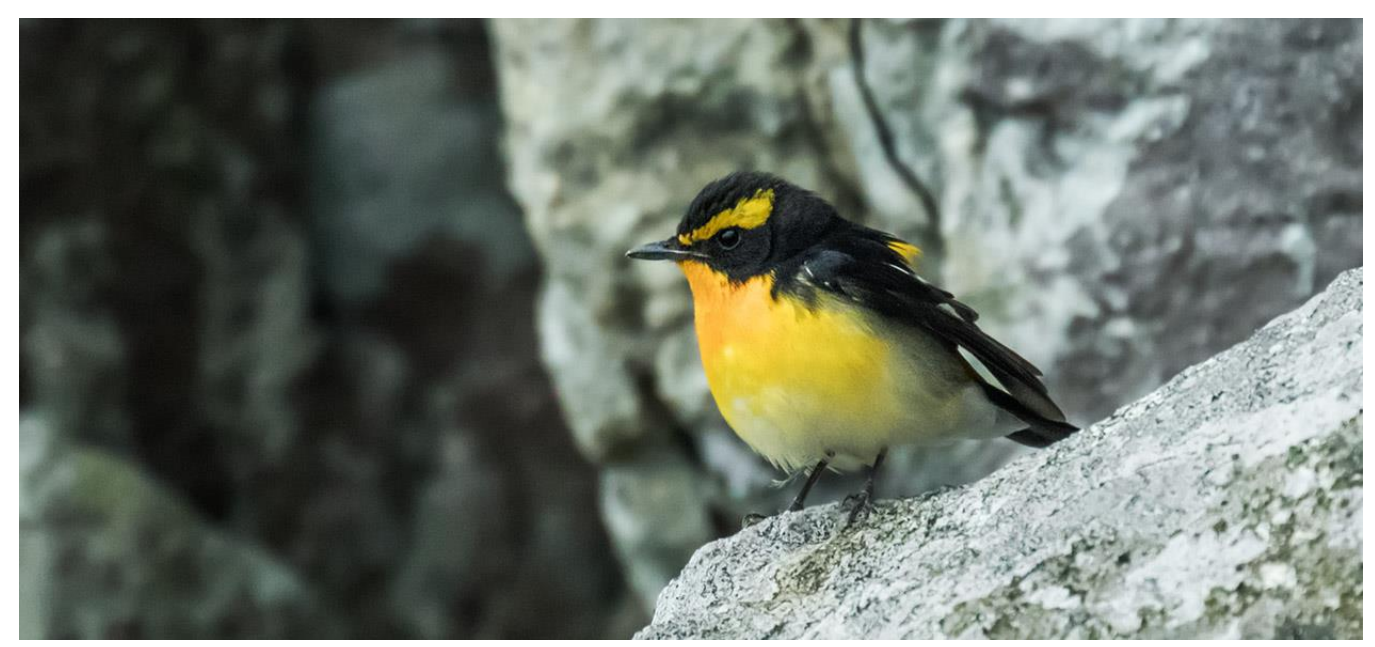
Narcissus Flycatcher near the lighthouse on Dongyin

15 April: We started the morning back at the running track, hoping to find some more birds before the joggers arrived and chased them away. Things started off well with a gorgeous male Yellow-breasted Bunting perched in the bushes – this species is now considered critically endangered due to recent precipitous population decline that is not fully understood, but is at least partly due to trapping during migration. Walking around the track, we also added Greater Sand-Plover, Wood Sandpiper, Common Snipe, and Sharp-tailed Sandpiper before heading back to the veggie garden. Only one photographer was present, but he had put out some mealworms that were attracting a gorgeous Forest Wagtail along with a few other species like Siberian Blue Robin. Activity was still good and many of the same species from yesterday were present, but some new species for the trip included Japanese and Brown-headed Thrushes, and Ashy Minivet. A Gray-faced Buzzard soared overhead along with more swifts and some Red-rumped Swallows. We covered various other sites on this little island over the course of the rest of the day, adding Yellow-rumped Flycatcher, Eastern Buzzard, Peregrine Falcon, Brambling, Pallas's Leaf Warbler, Eurasian Wryneck, and the always-entertaining Eurasian Hoopoe to the rapidly-growing list.