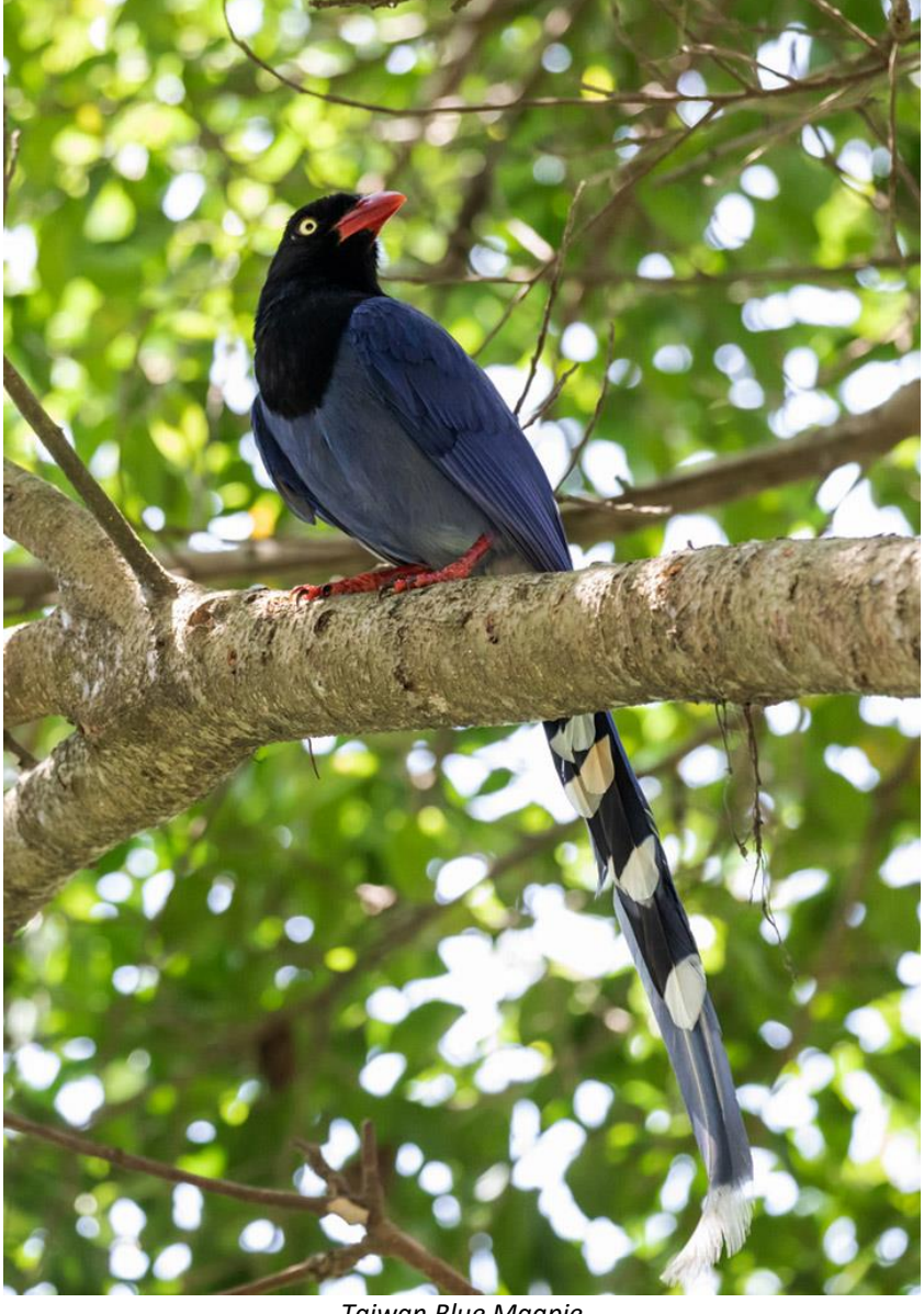
Taiwan Blue Maapie